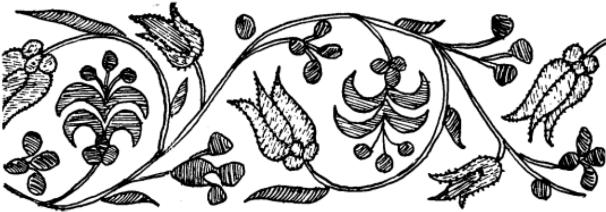
Fig. 2 (Berker, 1973, 22) Drawing of extant piece