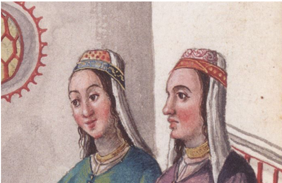
Fig. 4 Codex Vindobonensis 8626, 1586-1591. Detail