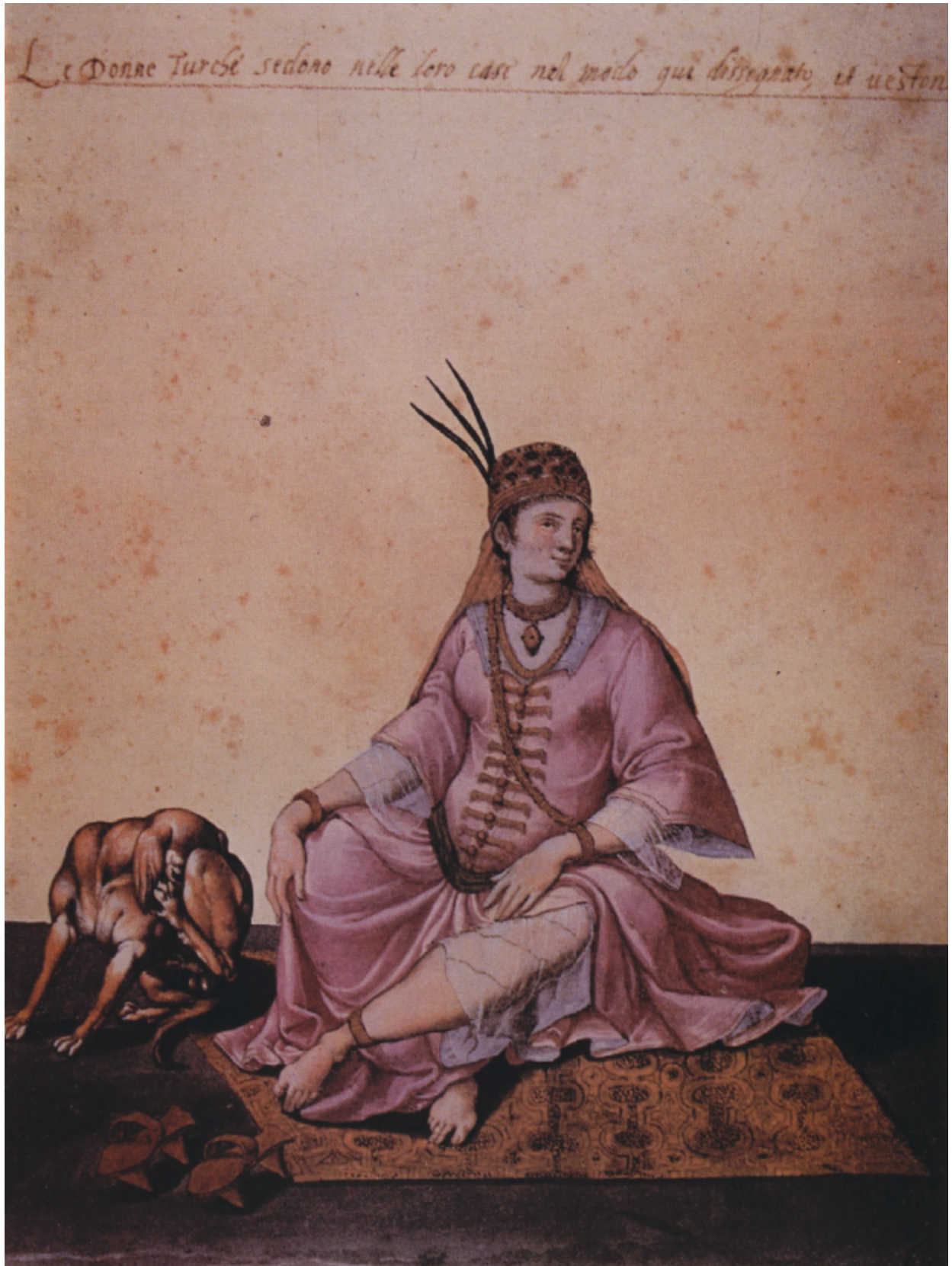
Fig. 5 Jacopo Ligozzi, c. 1577-1580