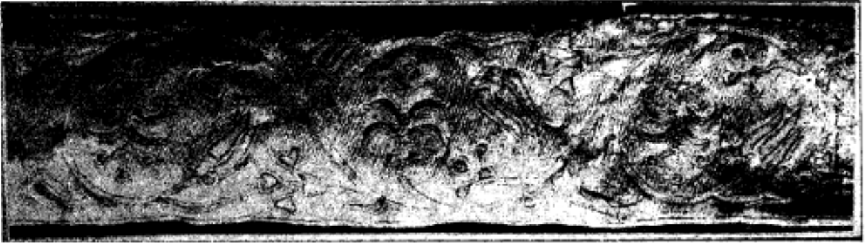
Fig. 1 (Berker, 1973, 22) Extant piece.