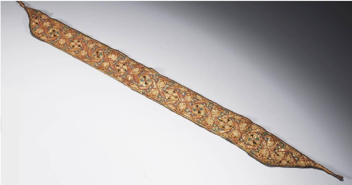
Fig. 7 Surviving kaşbastı belonging to Hurrem Sultan, wife of Suleiman the Magnificent (1520-1566) Topkapi Museum