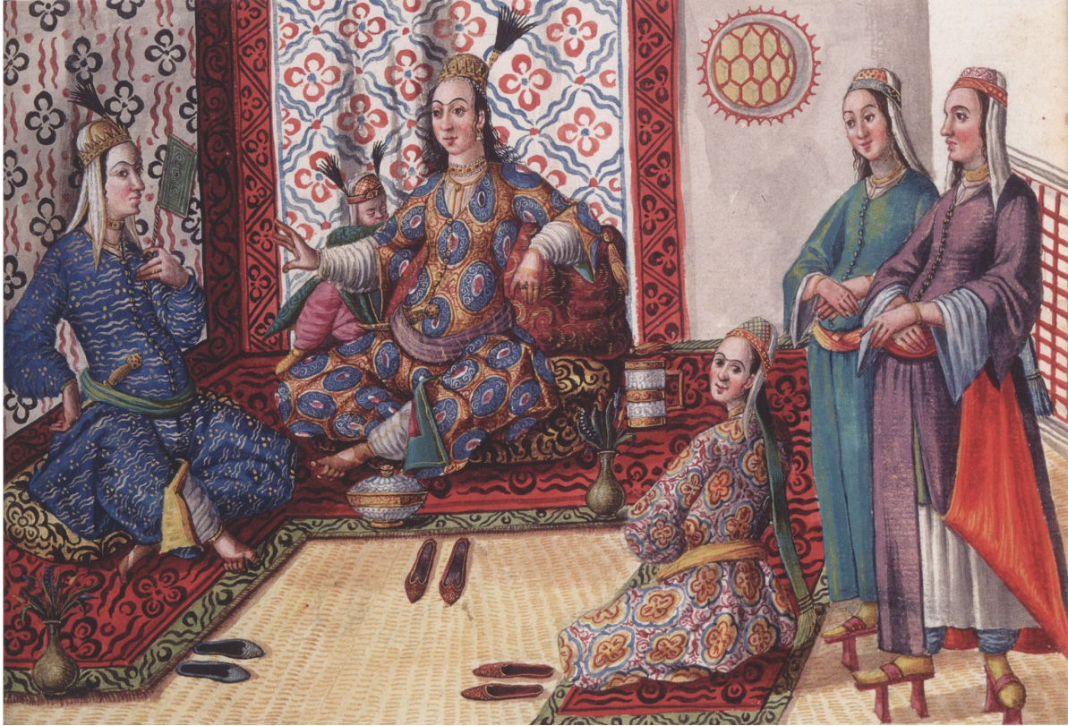
Fig. 3 Codex Vindobonensis 8626, 1586-1591.