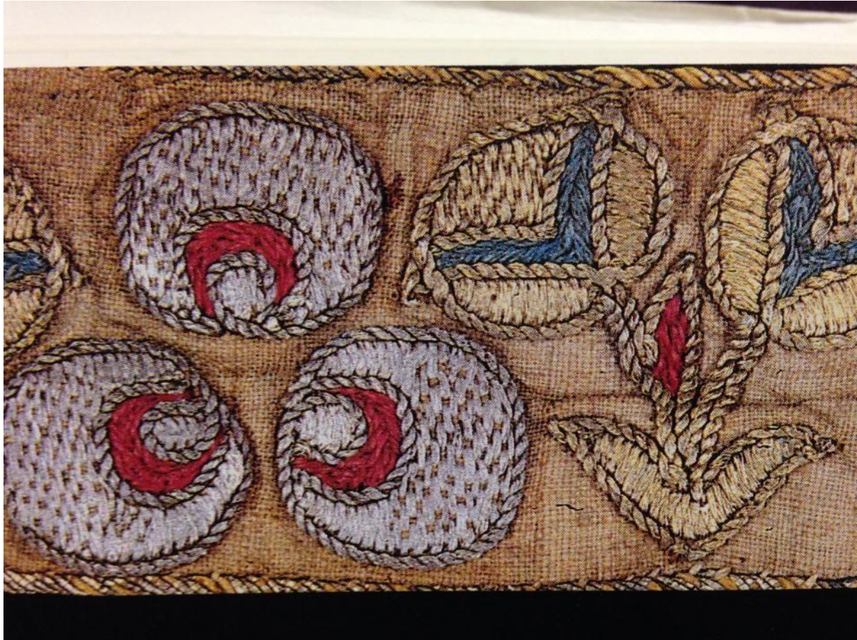
Fig 6. Extant kaşbastı fragment, also found in the tomb of Amehd I